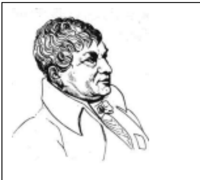
Benjamin Gompertz

In 1825 a British actuary, Benjamin Gompertz, discovered a pattern in human mortality. He found that the probability of dying was high at birth but then declined until sexual maturity. After this it increased at an exponential rate. He estimated that between the ages of 20 and 80 years, the risk of dying doubles with every additional 8 years that you live.